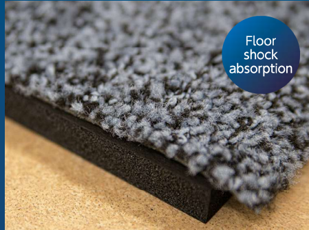
Floor shock absorption